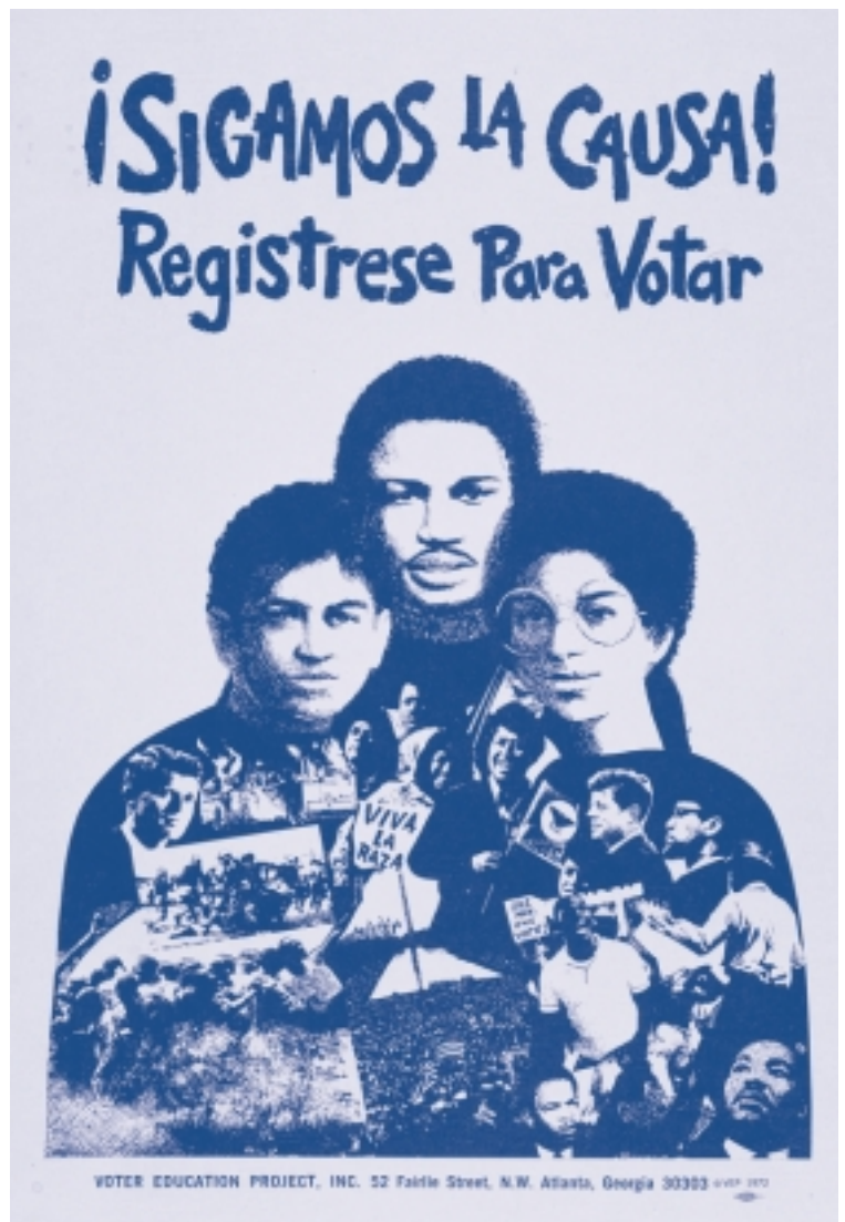
Sigamos La Causa! poster