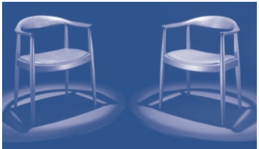
Nixon-Kennedy debate chairs

Television quickly eclipsed radio as the most important factor in shaping the president's public image. One of the first events to prove the power of television was the televised debate between presidential candidates John F. Kennedy and Richard M. Nixon. Many believe that Kennedy would not have won the election without the help of television. These debates ushered in a new kind of political strategy that recognized television's power to sway public opinion. In later years, Ronald Reagan's ease with television earned him the nickname "the Great Communicator."